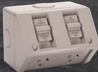
NLGPO10D SURFACE MOUNT GPO IP53 DOUBLE 10A 250V AC