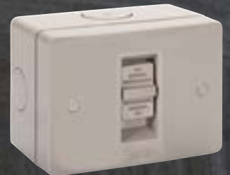
NLSW116L SURFACE SWITCH IP66 1 GANG 1 POLE 2 WAY 16A M80 250V AC LGE