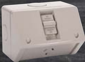
NLGPO10S SURFACE MOUNT GPO IP53 SINGLE 10A 250V AC